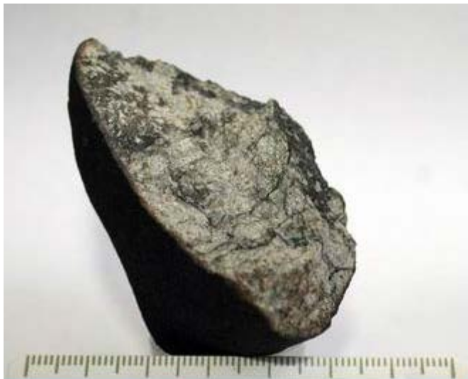
Chelyabinsk Meteorite

Fragment of Chelyabinsk, the LL5 ordinary chondrite that fell near Chebarkul Lake, Russia. Click for enlargement.