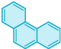
Phenanthrene C 14 H 12